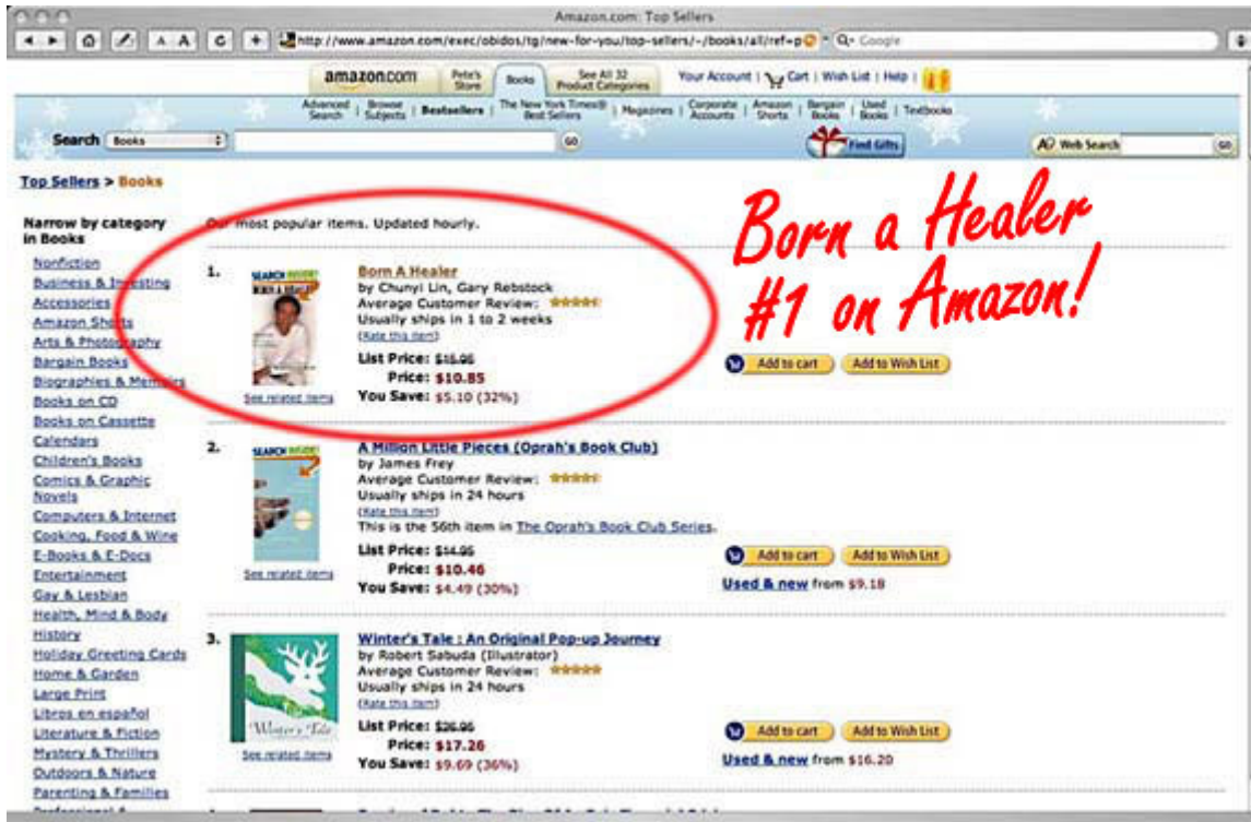
Exhibit #7 -- Gary Rebstock's Born a Healer at #1 on Amazon