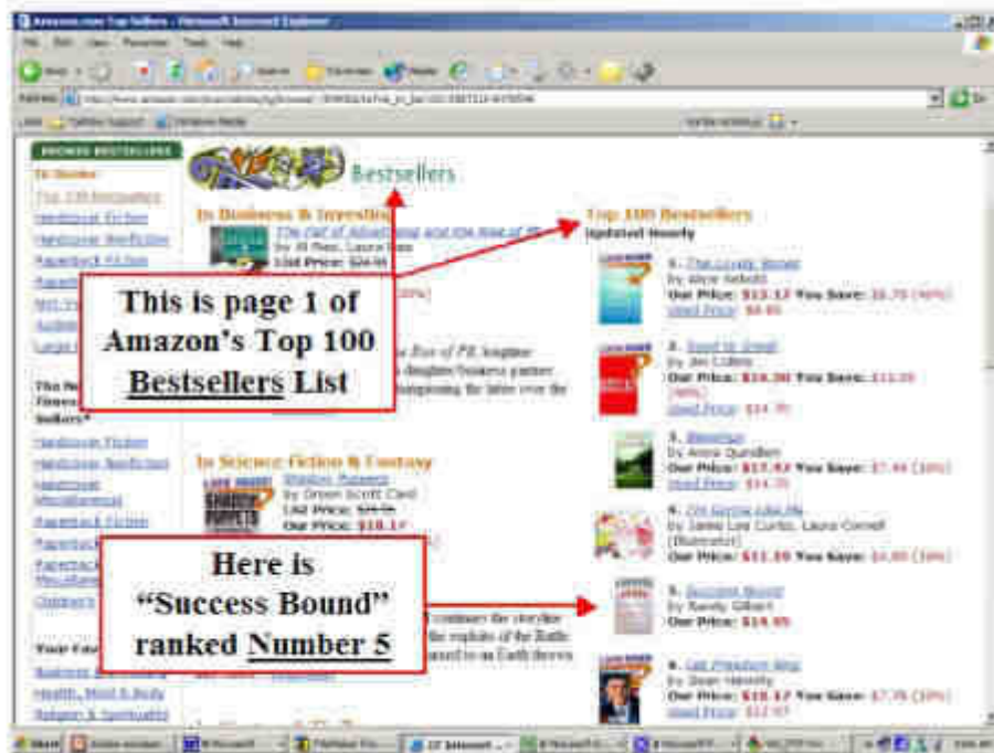
Exhibit #1 - Randy's book Success Bound at # 5 on Amazon's Bestseller List