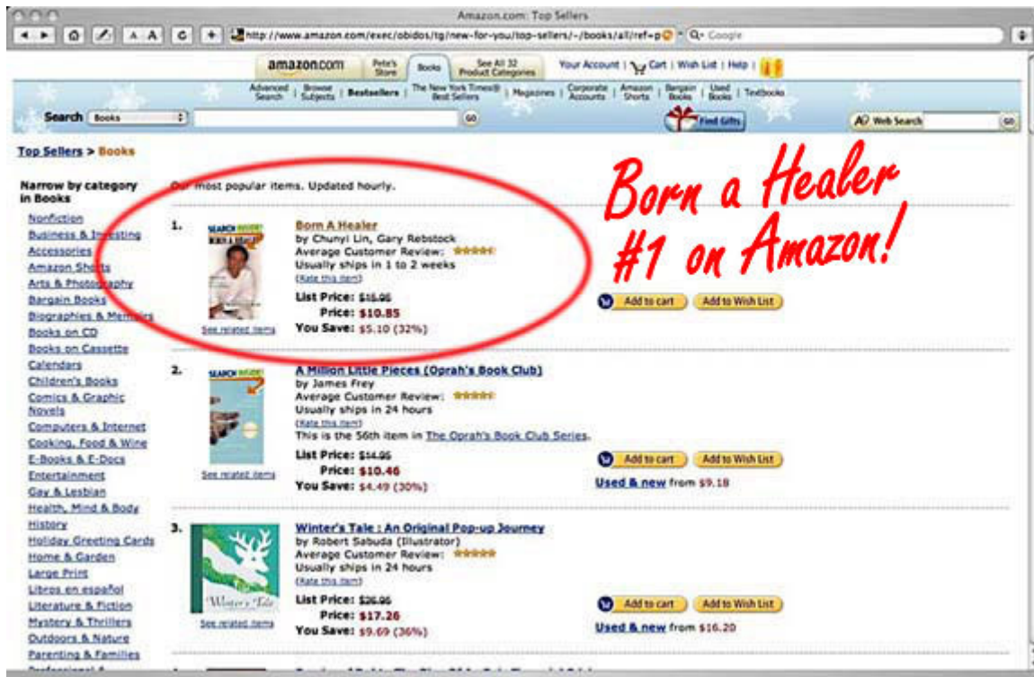
Exhibit #4 -- Gary Rebstock's Born a Healer at #1 on Amazon